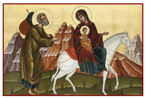
FLIGHT INTO EGYPT